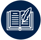
History & Heritage Management

A 4-year interdisciplinary programme that blends business education with a strong foundation in the social sciences developing analytical, ethical, and globally aware leaders.