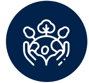
Public Policy & Sustainable Development

*For Undergraduate Programme multiple exit options under the National Education Policy: Certificate after Year 1, Diploma after Year 2, Bachelor's after Year 3, and Honours/Research Bachelor's after Year 4.