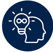
Philosophy & Ethics of Technology